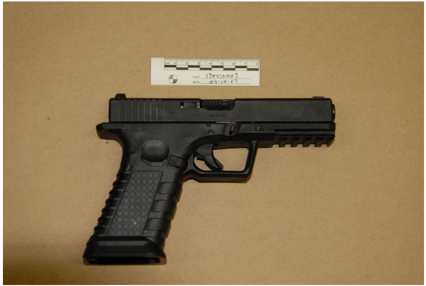
Firearm recovered from Perez following OIS